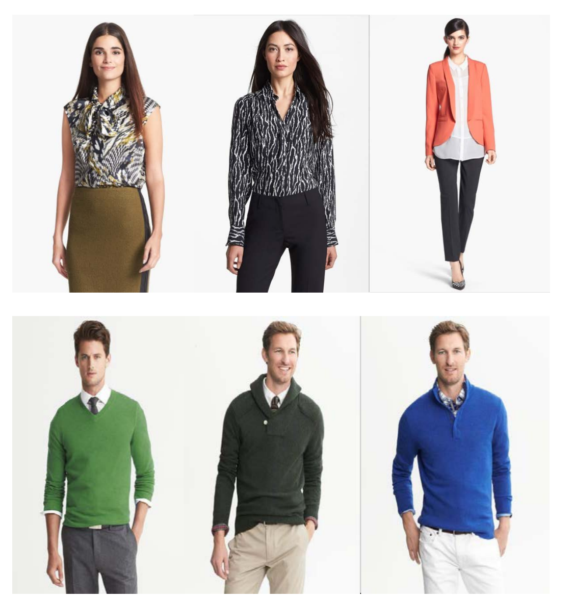
Most work envíronments may prefer covered arms so wear a cardígan or jacket

Sources: http://bananarepublic.gap.com http://shop.nordstrom.com