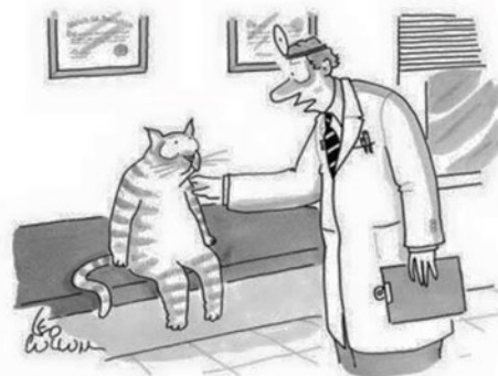
"Bad news, its curiosity"

We bless them and honor them in the name of the Father, Son and Holy Spirit. Amen