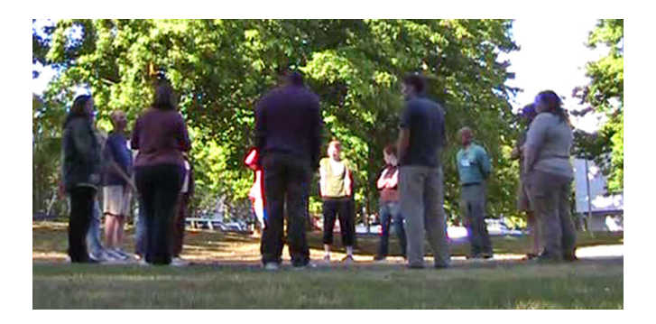
VIDEO 2. Participants prepare to enact Energy Theater for an incandescent bulb burning steadily. In this episode, participants discuss how a specific form of energy may be transformed into another form, and what the limitations may be on such transformations.